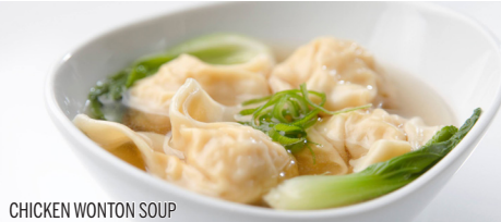
CHICKEN WONTON SOUP