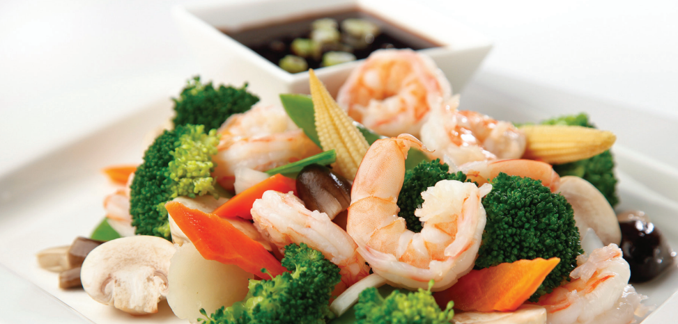
SHRIMP WITH MIXED VEGETABLES