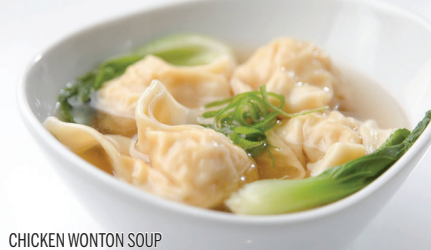
CHICKEN WONTON SOUP