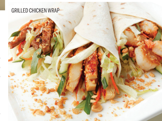
GRILLED CHICKEN WRAP