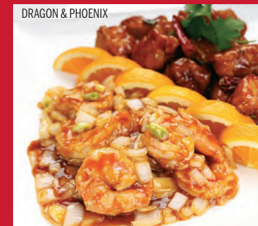
DRAGON & PHOENIX